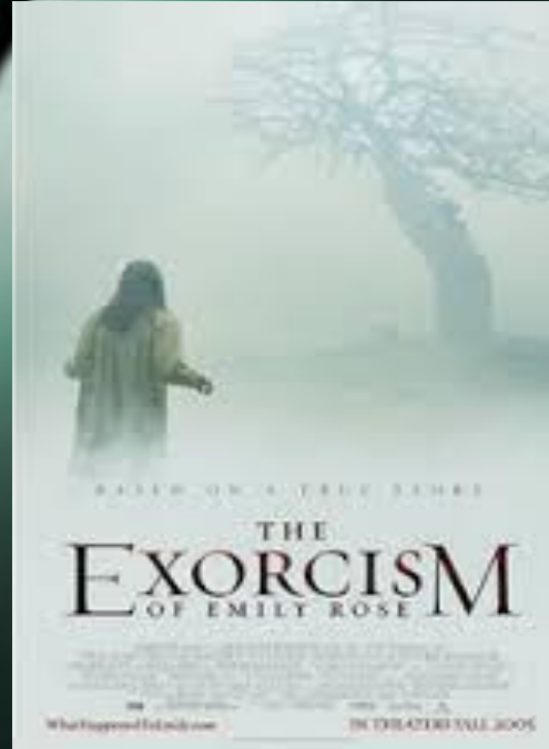
The exorcism of Emily Rose